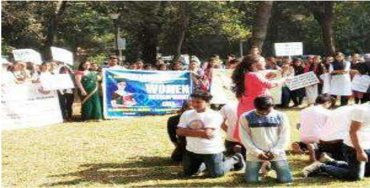
Street Play by WDC students