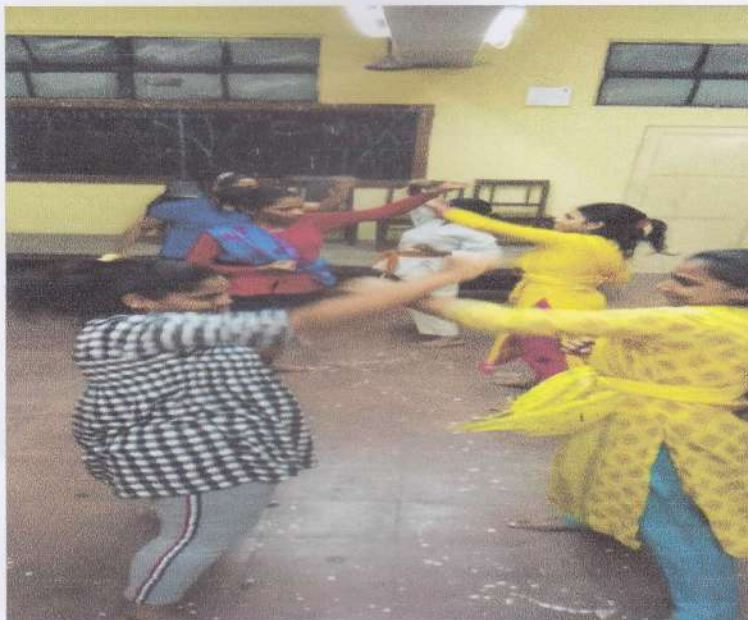
WDC conducted Certificate Course on "Self Defense for Women" from 3 rd Dec.2021 to 17 th Dec.2021.