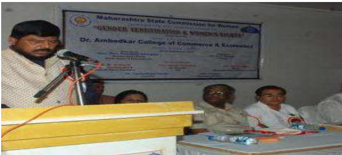
Seminar on Gender Sensitisation