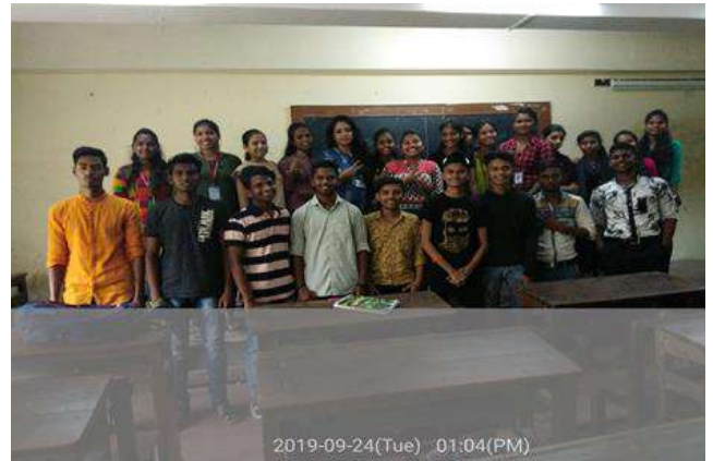
Kotak EWYL training-All FYBCOM Batch