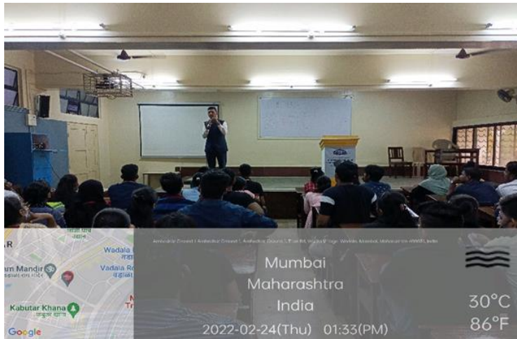
Orientation by DBM India & Mock Interviews under RBL-GTT training program