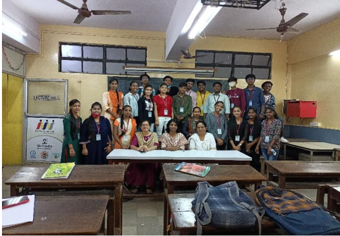
Interview Skills Program by Barclays-GTT & Communication skill session by Squad Infotech