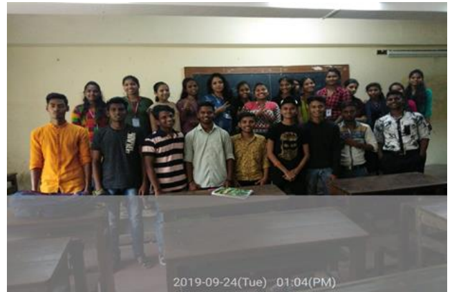
Kotak EWYL training-All FYBCOM Batch