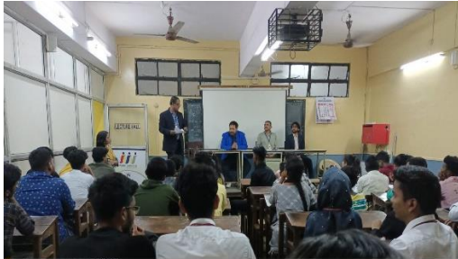
Wadala Depot, Wadala West, Wadala, Mumbai, Maharashtra 400031, India Mumbai Maharashtra India 33°C 91°F 2023-02-16(Thu) 11:34(am)