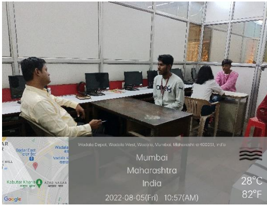
Wadala Depot, Wadala West, Wadala, Mumbai, Maharashtra 400031, India Mumbai Maharashtra India 28°C 82°F 2022-08-05(Fri) 10:57(AM)