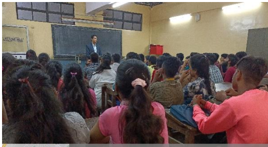
Wadala Depot, Wadala West, Wadala, Mumbai, Maharashtra 400031, India Mumbai Maharashtra India 30°C 86°F 2022-08-02(Tue) 10:45(AM)