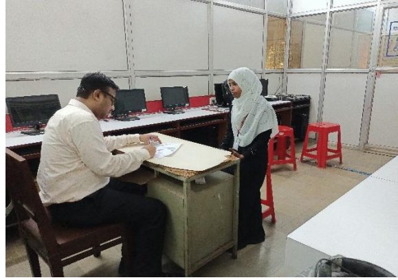
Wadala Depot, Wadala West, Wadala, Mumbai, Maharashtra 400031, India Mumbai Maharashtra India 28°C 82°F 2022-08-05(Fri) 10:57(AM)