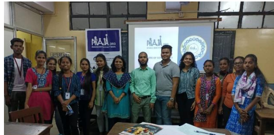
Wadala Depot, Wadala West, Wadala, Mumbai, Maharashtra 400031, India Mumbai Maharashtra India 32°C 90°F 2022-12-21(Wed) 11:55(AM)