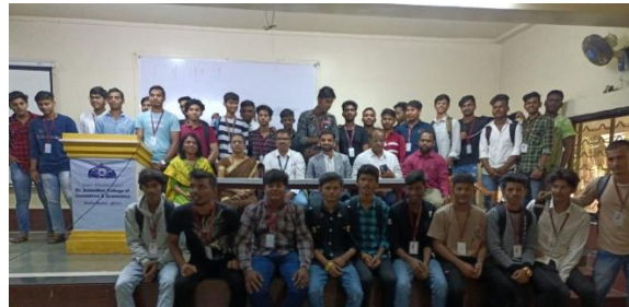
Wadala Depot, Wadala West, Wadala, Mumbai, Maharashtra 400031, India Mumbai Maharashtra India 30°C 86°F 2022-11-30(Wed) 11:31(AM)