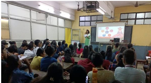
Wadala Depot, Wadala West, Wadala, Mumbai, Maharashtra 400031, India Mumbai Maharashtra India 31°C 88°F 2022-12-12(Mon) 11:04(AM)