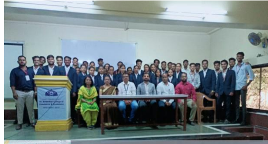
Wadala Depot, Wadala West, Wadala, Mumbai, Maharashtra 400031, India Mumbai Maharashtra India 30°C 86°F 2022-11-30(Wed) 11:30(AM)